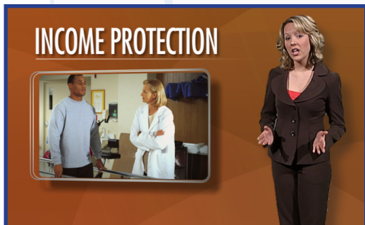
UNIVERS WORKPLACE BENEFITS

Media Imagery was pleased to welcome back The Salvation Army of Greater Phila. for a green-screen holiday fundraising TV spot in association with PECO. MI also posted a new HD PSA for WHYYY. The Salvation Army of Delaware selected MI to write, shoot and produce a promotional DVD for Delaware's Keep A Job program. MI and WMSH Marketing Communications also produced a fundraising promotional DVD for The Salvation Army's planned Ray and Joan Kroc Corps Community Center in Camden slated to open in 2011.